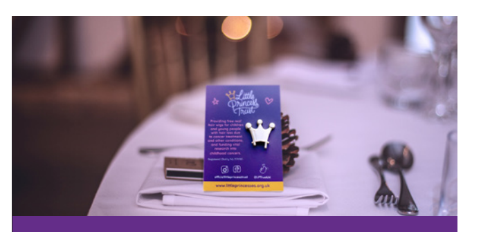
The LPT online shop was launched and features many great gift ideas