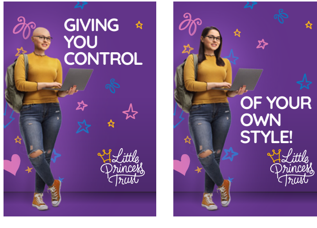
These lenticular cards were created to publicise our service to young hospital patients.